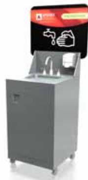
Stainless steel option

A self contained hand washing station with soap and towel dispenser. Header and side panels offer an area to place messaging and branding. These mobile units are weather proof and can be used in common areas inside or outside. These can be operated via foot pump and have a hands-free option for minimizing contact points. A refillable reservoir and gray water holding tank are included beneath the cabinet so facilities management personnel can access for service.