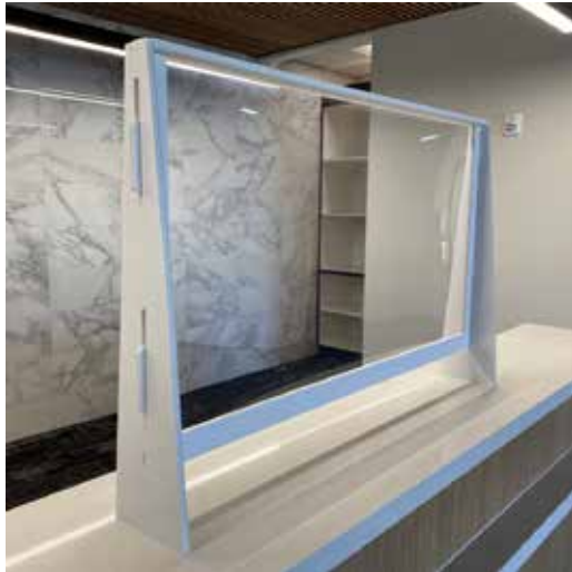
Large: 48"W x 30"H

Acrylic shields can be expensive and with so many COVID-19 related materials needed to open your business safely – these lightweight desk guards are the perfect fit.