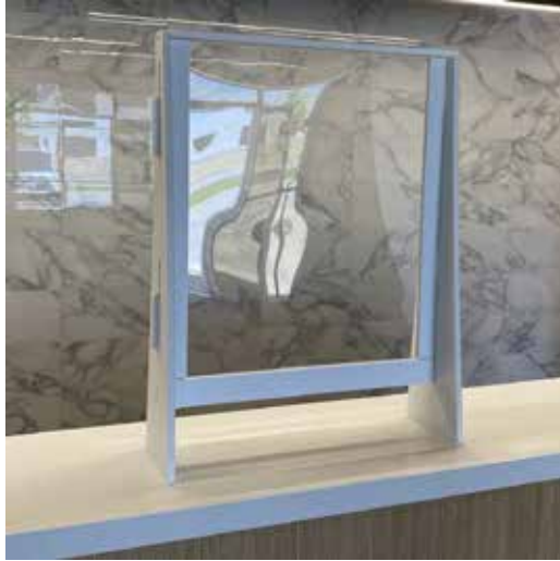
Small: 24"W x 30"H